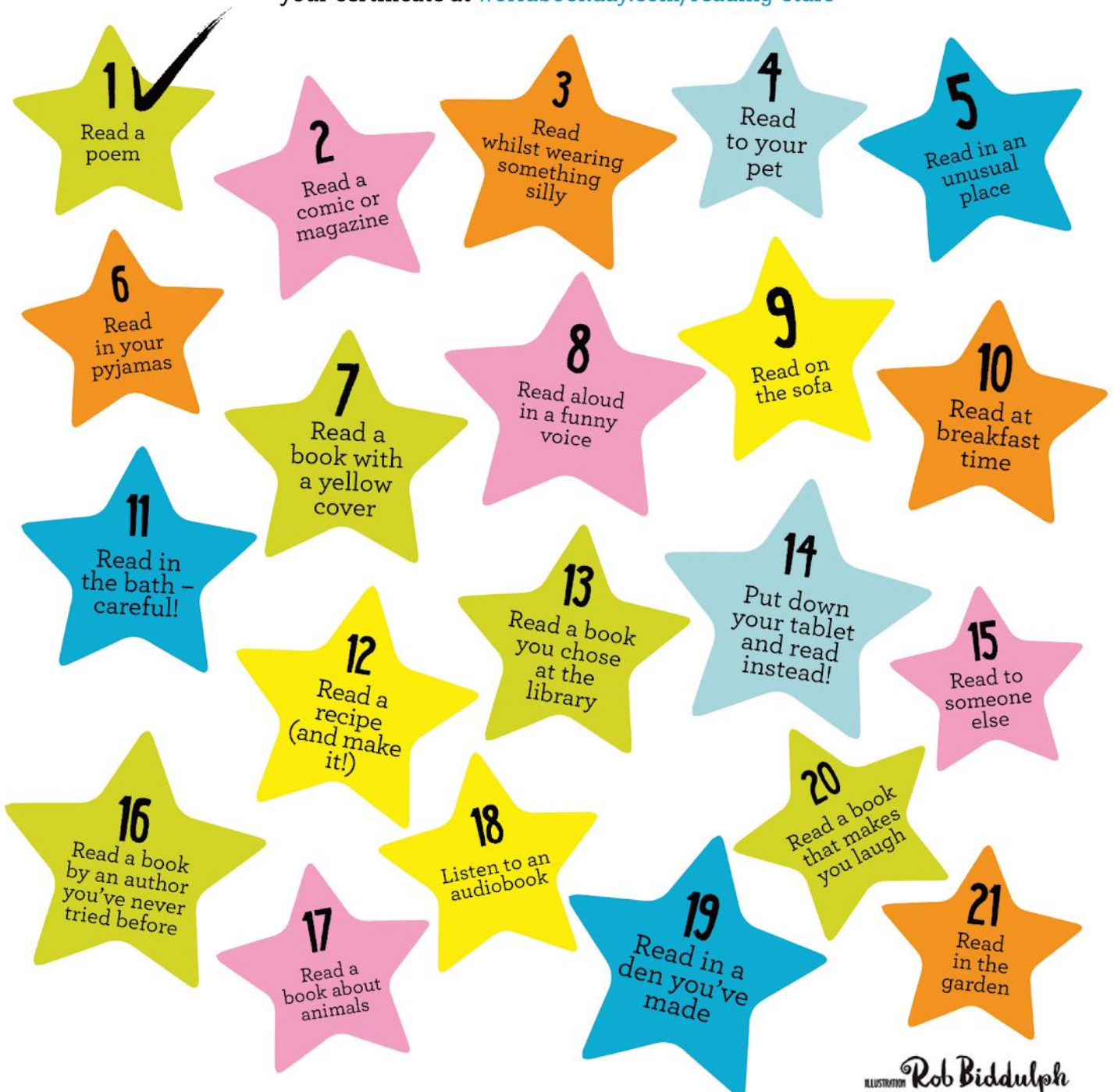
ILLUSTRATION Rob Biddulph

Tick off a Reading Star each time you complete a reading task and have fun reaching all your stars! You can also play the game online and download your certificate at worldbookday.com/reading-stars